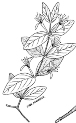
Orange Honeysuckle Lonicera ciliosa