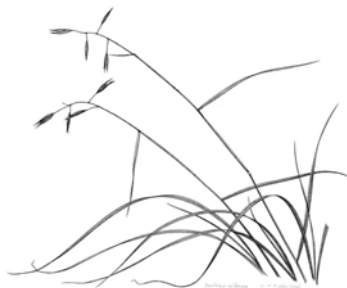
California Oat Grass Danthonia californica